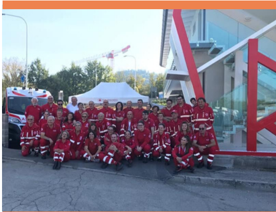
The new building of the Committee