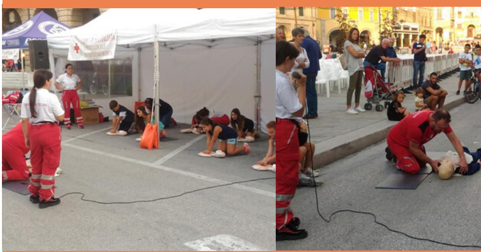
First Aid Course

Croce Rossa Italiana COMITATO DI SAN SEVERINO MARCHE