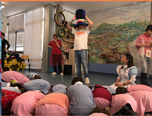
Activities with children